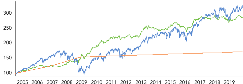
RIC total return NAV — FTSE All-Share TR — Twice Bank Rate